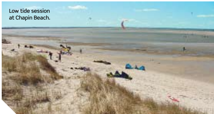
Low tide session at Chapin Beach.