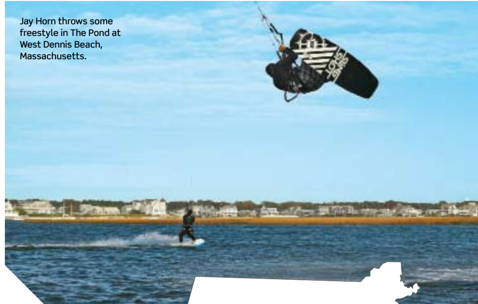
Jay Horn throws some freestyle in The Pond at West Dennis Beach, Massachusetts.

The cape's unique geography and proximity to three major bodies of water — the Atlantic Ocean, Cape Cod Bay and Nantucket Sound — allows for diverse riding styles. There are numerous flat-water spots available year-round and great surf throughout the spring and fall. Plus, unlike most of the East